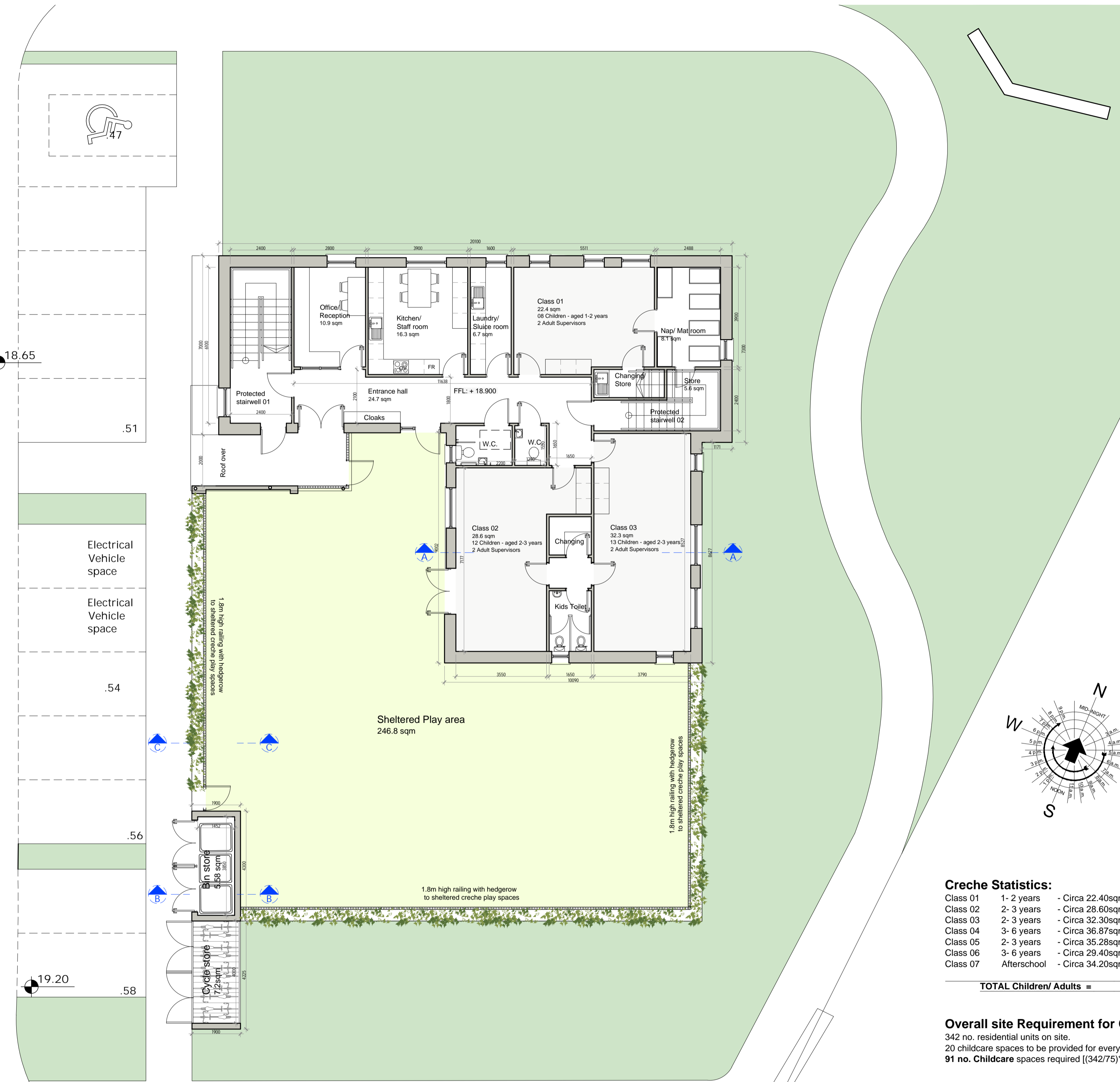
01 Creche Ground Floor Plan Scale 1:100 Area: 199.4 sqm Overall Creche Area: 398.8sqm :- 4293 sqft